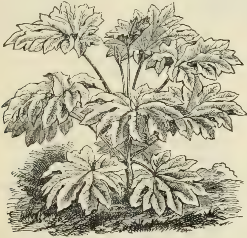
ARALIA PAPYRIFERA. Page 10.